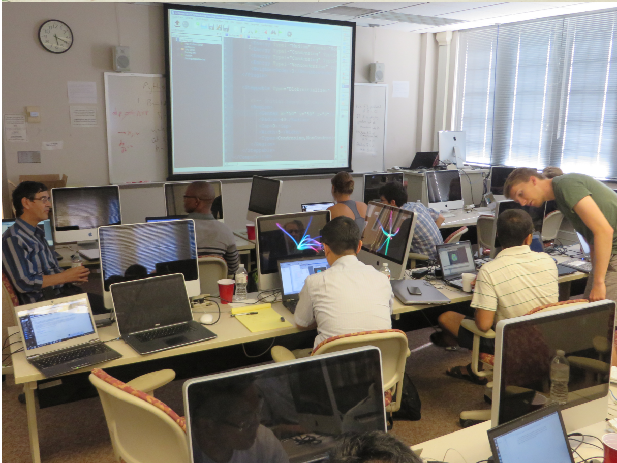
Group Photo (top) & Participants at the CompuCell3D and SBW 11th User Training Workshop (bottom)